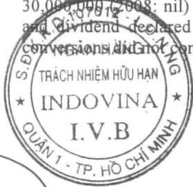
Yei-Fong Jan General Director 22 March 2010

Cash inflow from capital contribution during the year ended 31 December 2009 excludes an amount of USD 30,000,000 (2008: nil) and USD 5,000,000 (2008: USD 4,250,000), representing an amount of other payables and dividend declared to shareholders but was converted as capital contribution, respectively. Since these conversions did not constitute movement of cash, they were not reflected in the above statement.